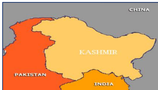
Figure 2: The Owen Dixon Plan 2